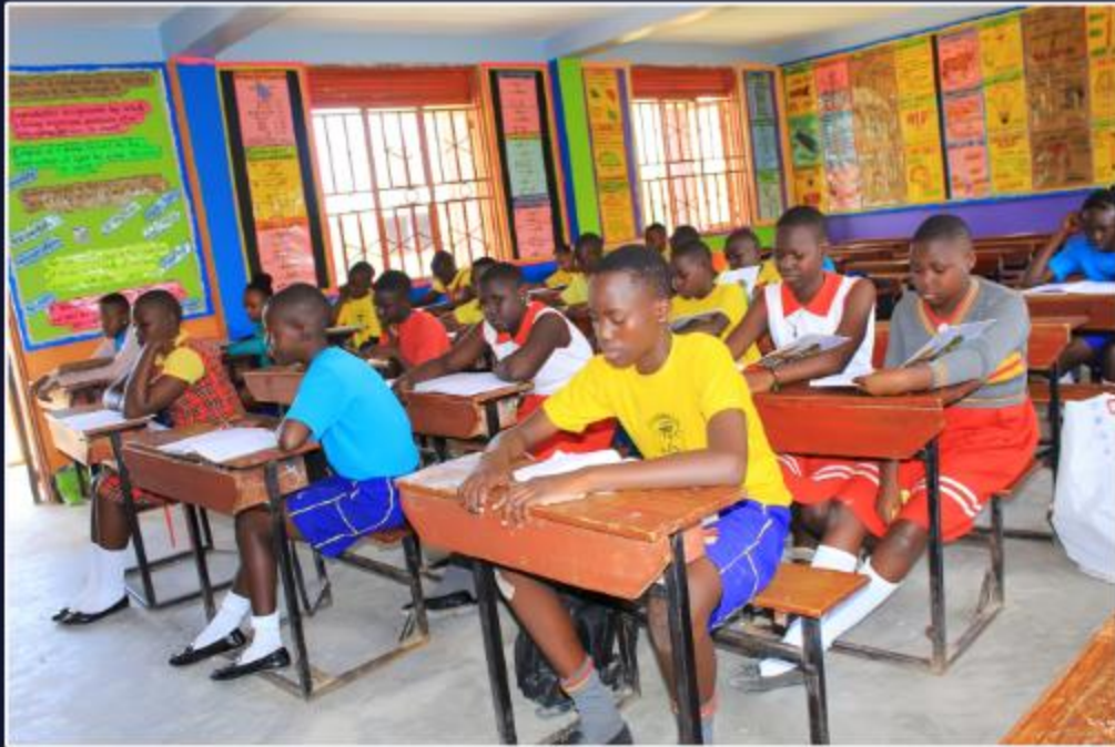
Silence: Candidate class focus on End of Term Revision