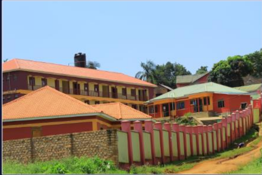
The Centre is secure and safe for child development