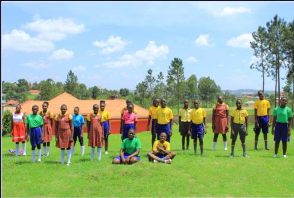
Happy Children in a spacious study facility