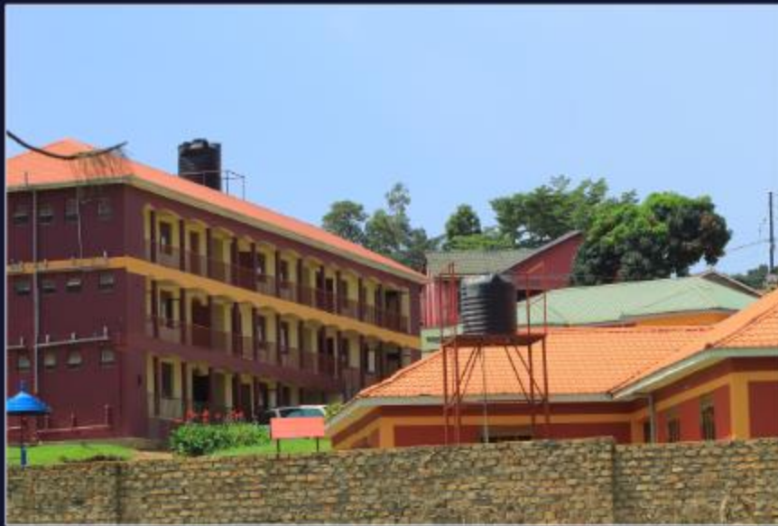
The centre has work in- progress