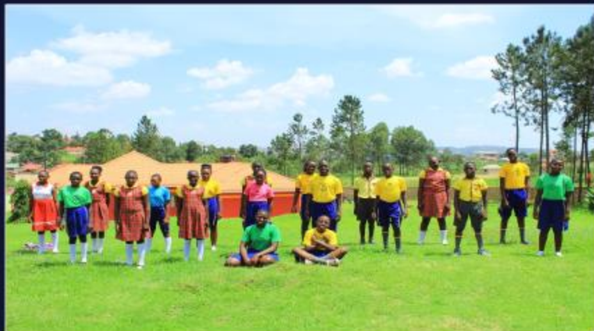
Primary 7 candidate class 2021.Relax after mid-morning tea break