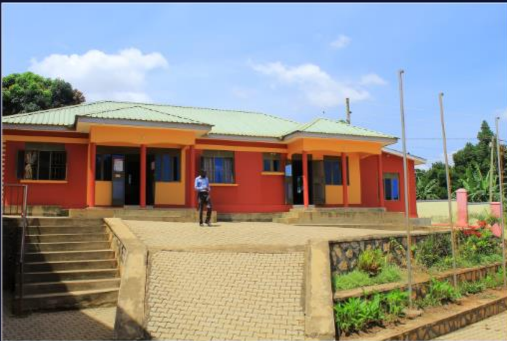
The Administration Block