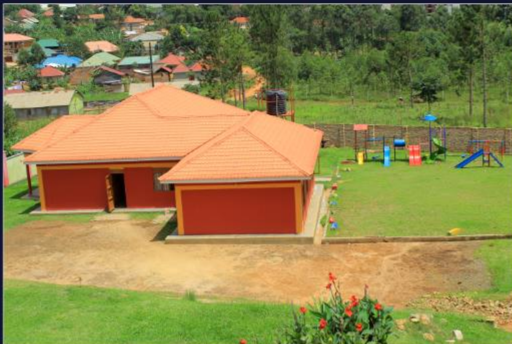
Ariel view of the Pre-primary Section