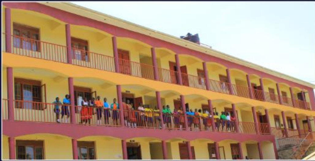
Side view of Namuwaya Building Complex 2020

Technology driven investments, community-moral support, family unity and true love for